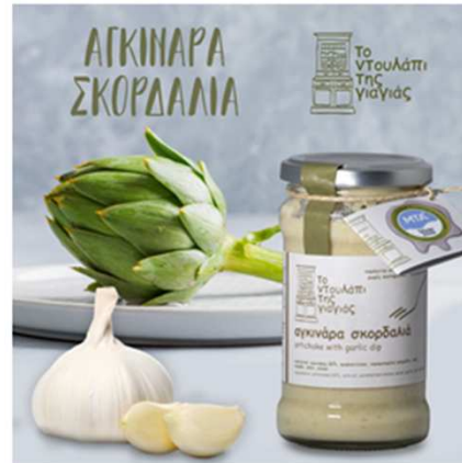
Artichoke with garlic dip