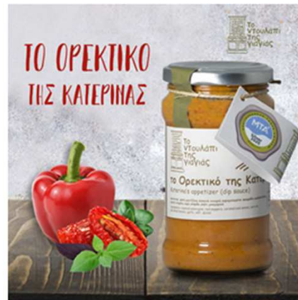
Katerina's appetizer (dip sauce)