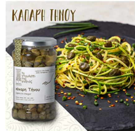
Capers in vinegar